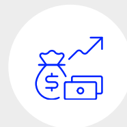
Revenue & Cost